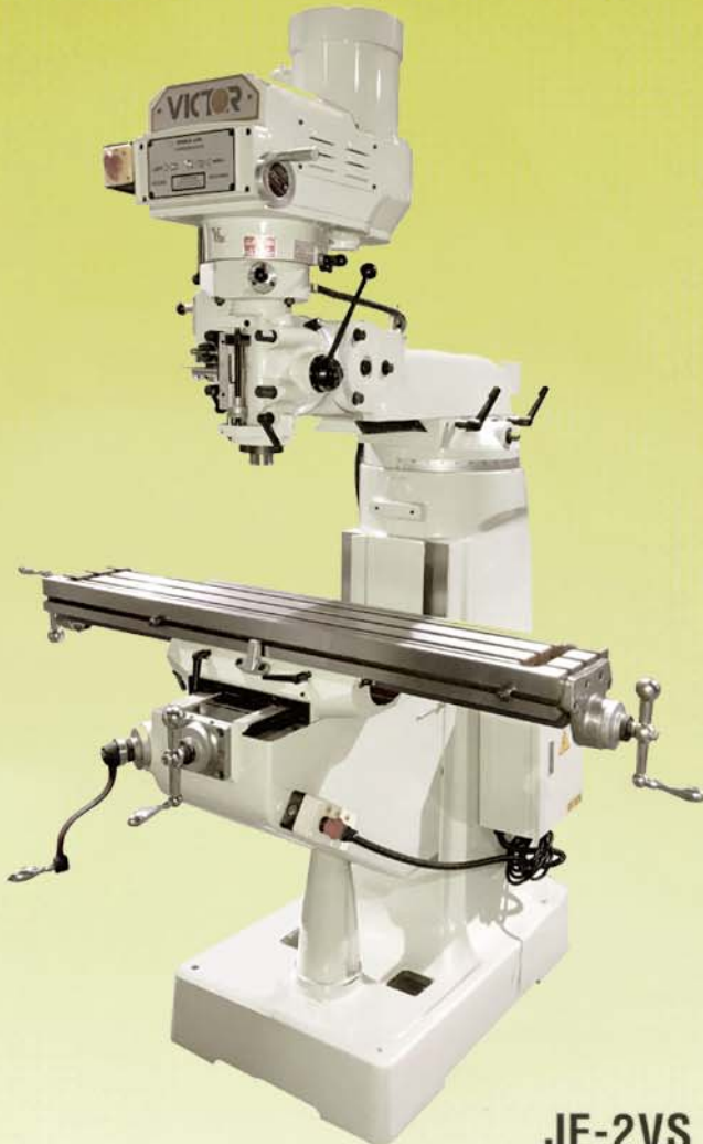
JF-2VS Vertical Turret Mill