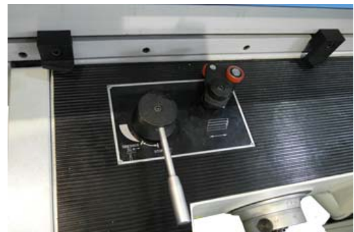
Table longitudinal movement speed control lever