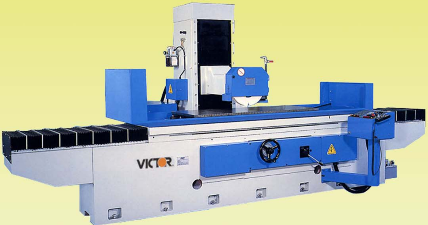
PFG-2460AHR COLUMN TYPE SURFACE GRINDER SHOWN