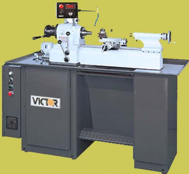
VICTOR 616EVS-CT Second Operation Lathe High Speed, High Accuracy & Electronic Variable Speed