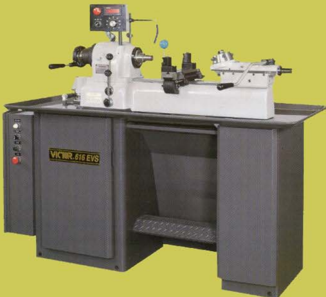
VICTOR 616EVS Second Operation Lathe High Speed, High Accuracy & Electronic Variable Speed